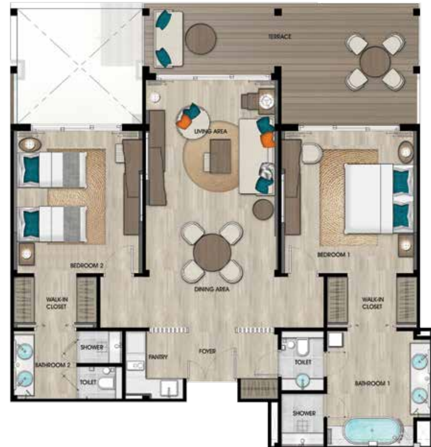
2 BEDROOM SUITE (132 Sq.m.)

Featuring a rustic tropical design that compliments the natural private vistas landscape, this luxurious 2 Bedroom Suite of 132 sq.m. (upper floor) opens up to a spacious living area and balcon. Large floor to ceiling windows in all rooms opens up to the natural breezes so that you can enjoy your perfect holiday. The luxurious 2 Bedroom Pool Suite of 156 sq.m. (lower floor) enjoys the same open design as the upper floor while seamlessly blending the spacious living area with the outer deck and large private pool taking full advantage of the beautiful ocean.