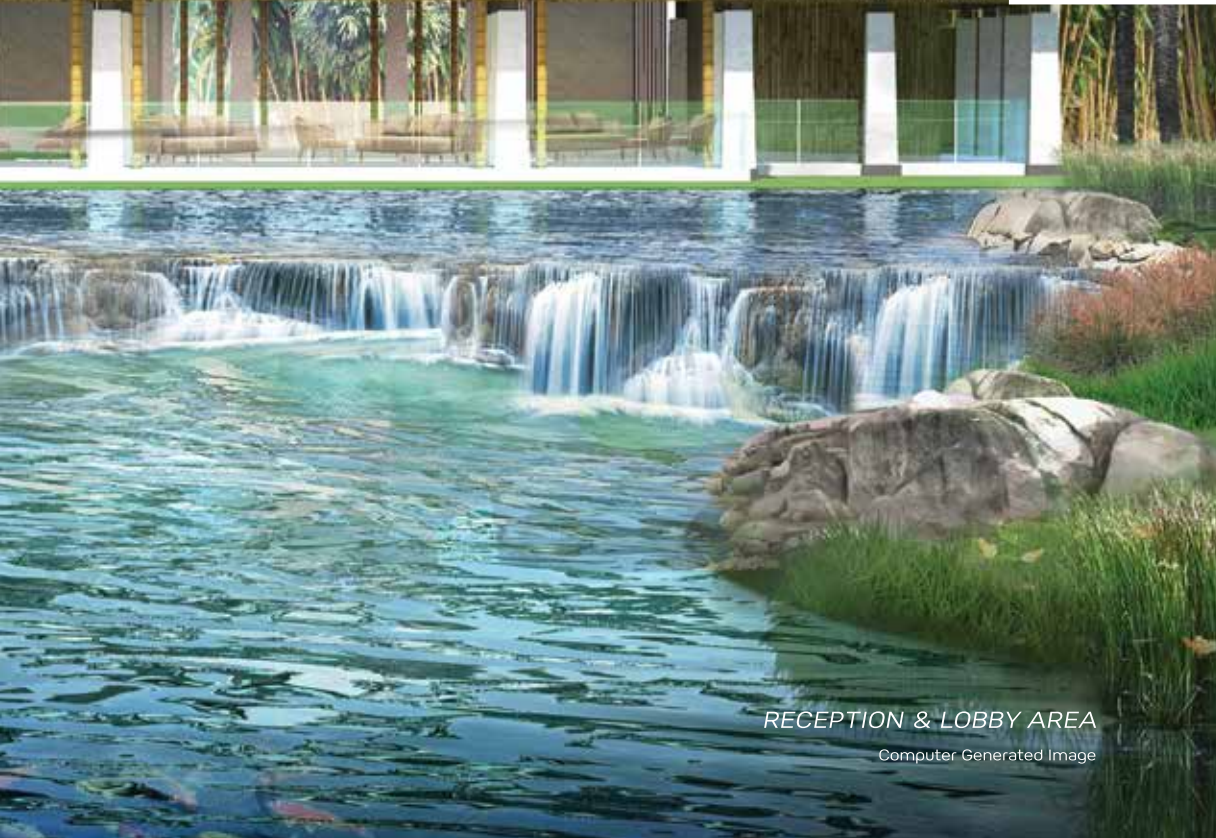
RECEPTION & LOBBY AREA