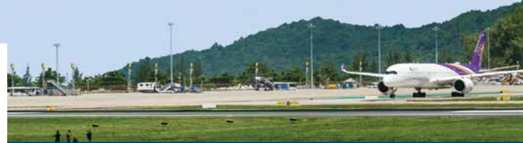
KRABI INTERNATIONAL AIRPORT