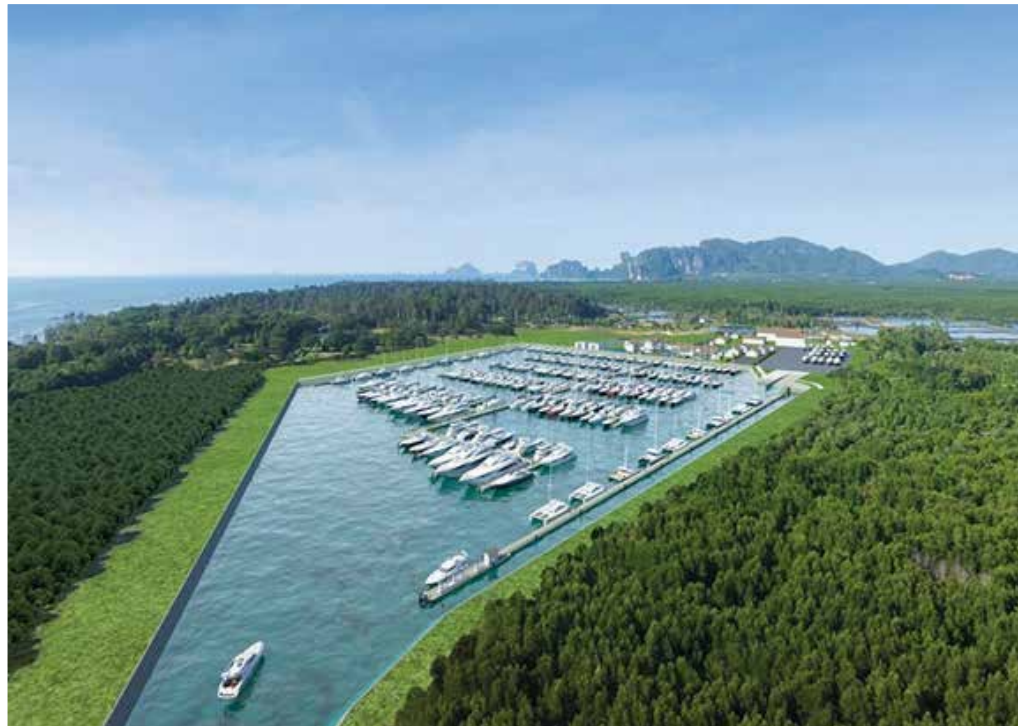
PORT TAKOLA YACHT MARINA & BOATYARD KRABI

Port Takola Yacht Marina & Boatyard Krabi and Krabi Boat Lagoon Marina and golf courses are just a short drive away. Many amazing natural attractions and famous cultural landmarks are found nearby, making this location easily accessible yet private and peaceful.