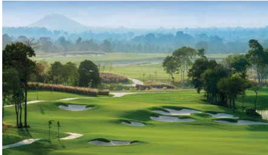
PAKASAI COUNTRY CLUB