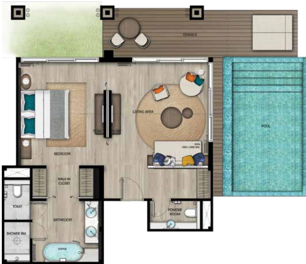
1 BEDROOM POOLSUITE (98 Sq.m.)

The rustic tropical design gracefully blends with the surrounding waterfalls and lagoons to create your own private oasis. This luxurious One-Bedroom Suite of 81 sq.m. (upper floor) features a large bedroom and living area with private balcony overlooking the beautiful tropical landscape for your exclusive getaway. The luxurious One-Bedroom Pool Suite of 98 sq.m. (lower floor) features the same open design as the upper floor with spacious living area, private pool and terrace flowing into one grand lofty area for your complete relaxation.