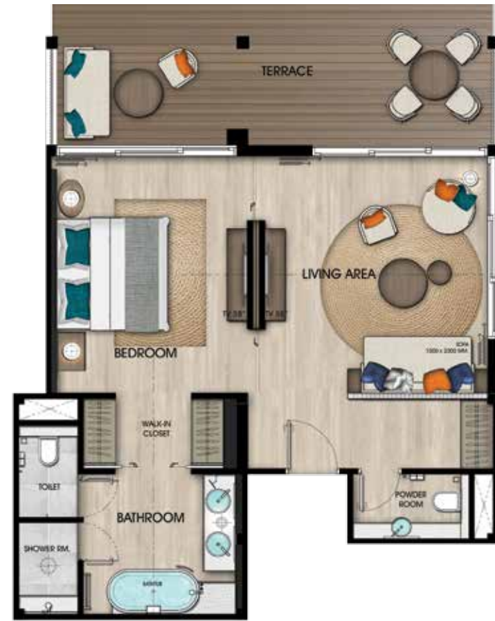
1 BEDROOM SUITE (81 Sq.m.)