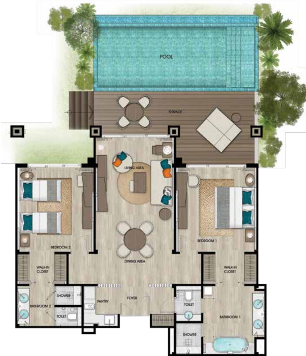
2 BEDROOM POOL SUITE (156 Sq.m.)

Featuring a rustic tropical design that compliments the natural private vistas landscape, this luxurious 2 Bedroom Suite of 132 sq.m. (upper floor) opens up to a spacious living area and balcon. Large floor to ceiling windows in all rooms opens up to the natural breezes so that you can enjoy your perfect holiday. The luxurious 2 Bedroom Pool Suite of 156 sq.m. (lower floor) enjoys the same open design as the upper floor while seamlessly blending the spacious living area with the outer deck and large private pool taking full advantage of the beautiful ocean.